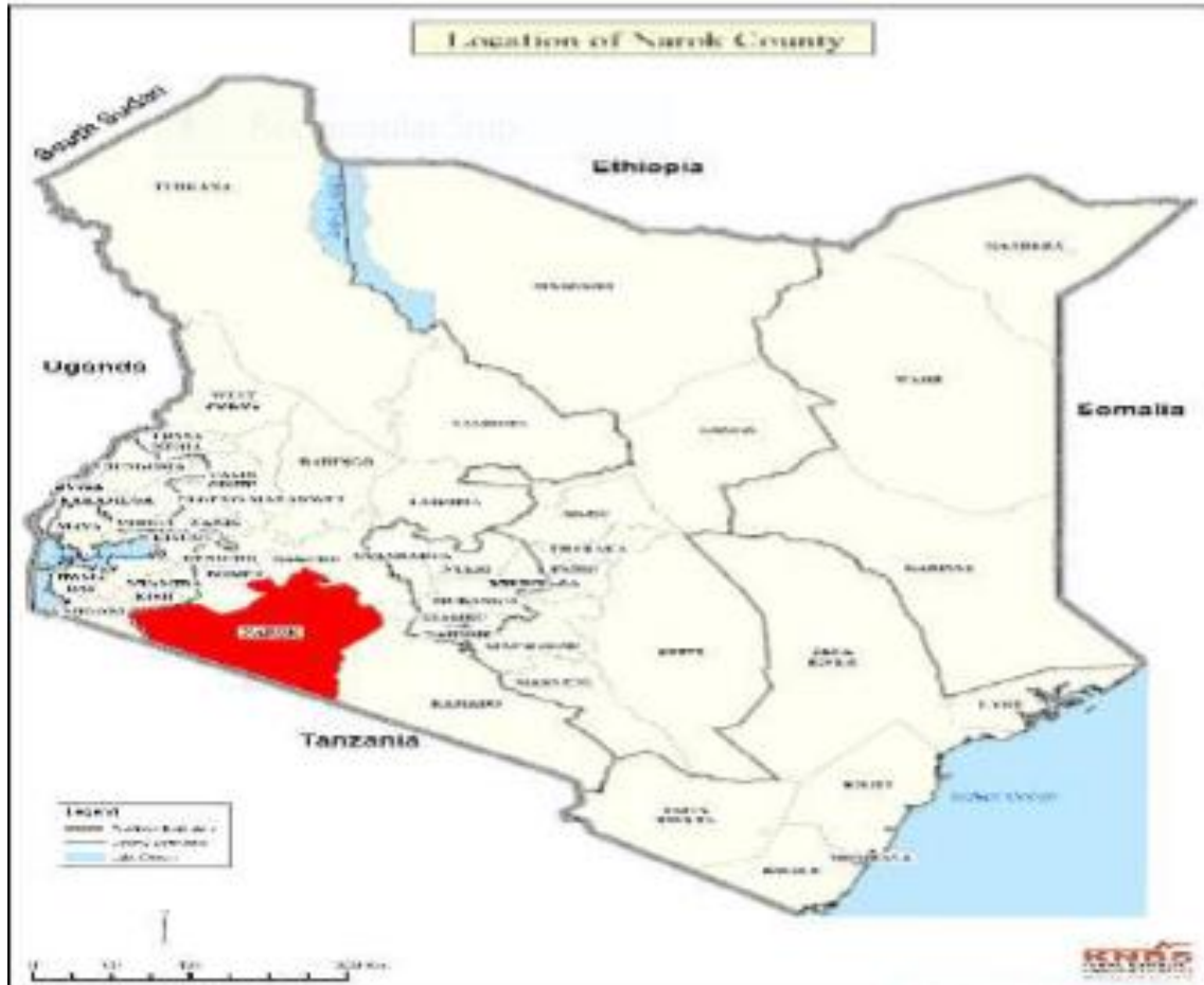
Figure 1: Location of Narok County