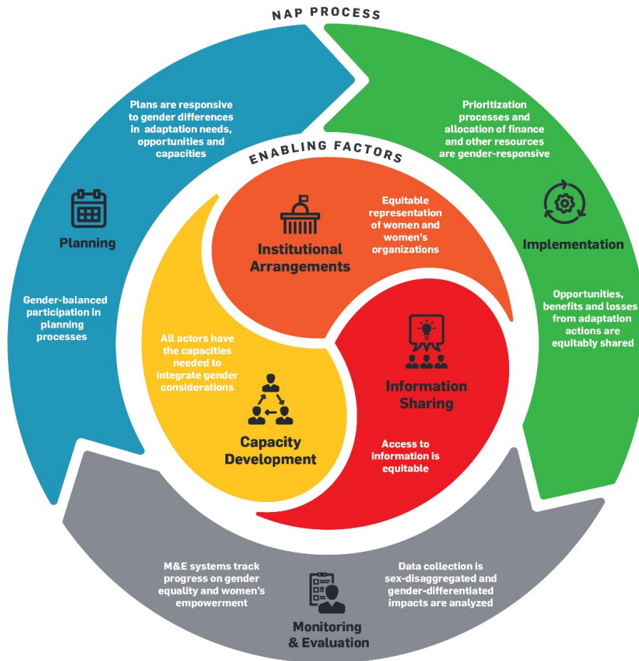
Figure 1: Implementation Framework

Our urban agenda is clearly aligned with the New UN Habitat Urban Agenda that recognizes the potential of cities if well planned to realize sustainable development goal in an integrated and coordinated manner. Our proposal to fulfill our own obligations towards meeting the 2030 Agenda for Sustainable development will focus on ending poverty and hunger, reducing inequalities, promoting inclusivity, economic growth and realizing gender equality and women and girls' empowerment.